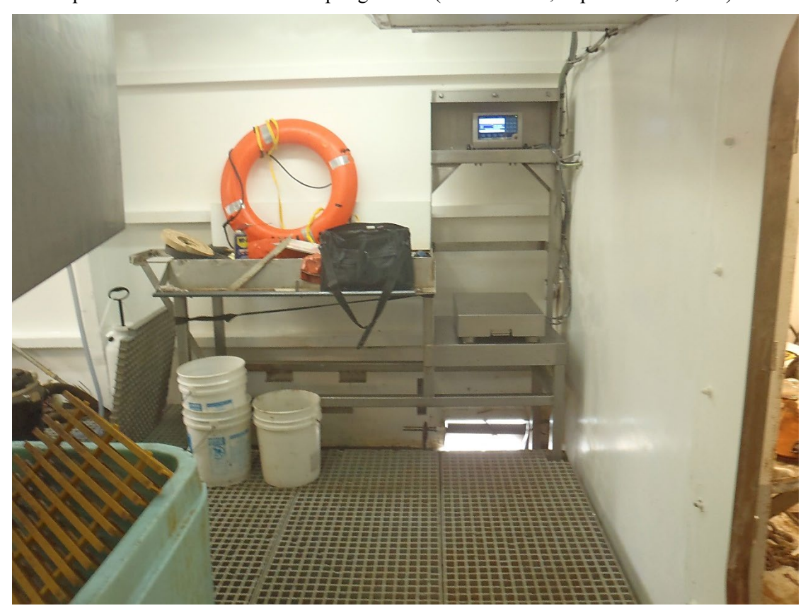
Figure 2-2 Observer sampling station with motion-compensated platform (MCP) scale.

Gulf of Alaska Rockfish Program. Additionally, all hook-and-line CPs targeting BSAI Pacific cod are also required to have an observer sampling station (77 FR 59053, September 26, 2012).