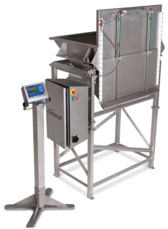
Figure 2-4 Hopper scale. This image is for example purposes only and does not represent an endorsement by NMFS.