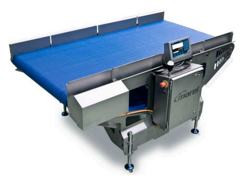
Figure 2-3 Flow scale. This image is for example purposes only and does not represent an endorsement by NMFS.