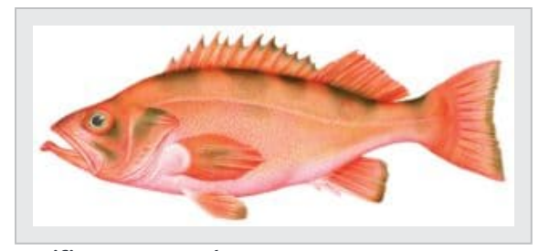
Pacific Ocean Perch

The purpose of this action is to address changes in the fishery which would increase flexibility and efficiency, improve functionality, and better ensure the total allowable catch for the primary rockfish species is fully harvested and landed in Kodiak as intended. Unforeseen changes in the Central GOA rockfish fishery in recent years to include the continuing Coronavirus disease (COVID-19) pandemic conditions, impacts to the GOA flatfish market due to the continuing foreign trade tariffs, and the loss of several shorebased processing facilities