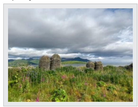
Dutch Harbor, Alaska

The Committee also wanted to highlight the following funding opportunities available under the Infrastructure Investment and Jobs Act: