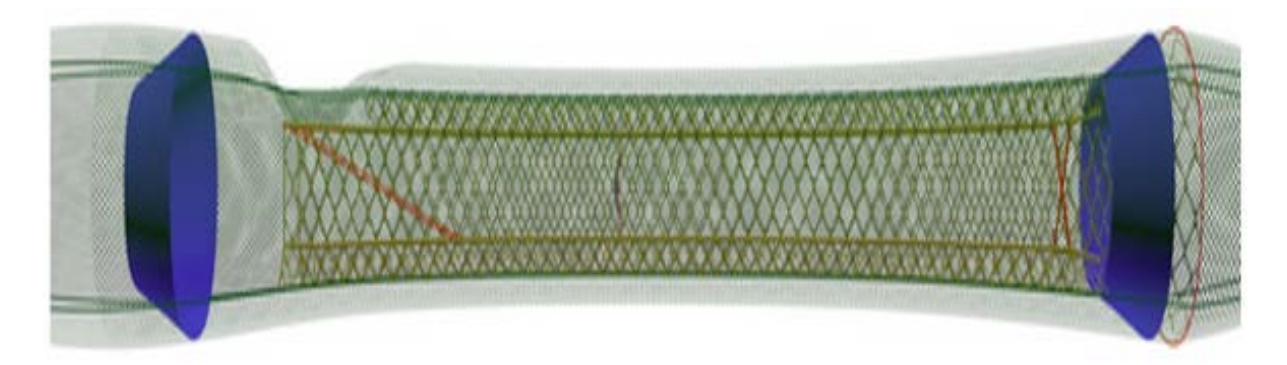
Figure 3: Conceptual depiction of a "hallway" halibut excluder (top view)

Hallway excluders can be rolled onto the vessel's net reel with less chance of distorting the shape of the panels or damaging the excluder. The ability to roll the excluder onto the net reel saves considerable time bringing the net on board relative to earlier designs. Hallway excluders also provide considerably more surface area for separating fish and that, in conjunction with the parallel orientation to the water flow, makes hallway excluders less vulnerable to clogging and "gilling" of target fish problems experienced with earlier excluders.