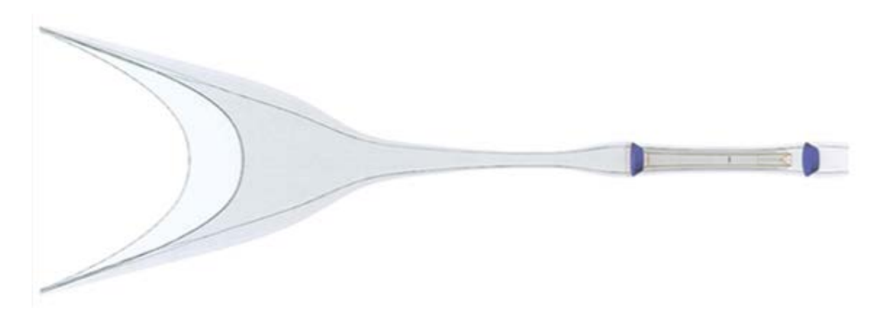
Figure 4: Conceptual drawing illustrating a hallway halibut excluder installed in a flatfish net

Formalized testing of some hallway-style versions of excluders developed for the Bering Sea was done fairly recently on smaller, lower-opening U.S. West Coast trawls off the coast of Oregon (Lomeli and Wakefield 2013, 2016, Lomeli et al. 2017). This provided field-based validation of their effectiveness, but differences in trawl design and operational characteristics between the two fisheries likely mean those results are only indirectly applicable to Bering Sea fisheries where use of such excluders is more extensive. This is because Bering Sea flatfish trawlers use of four-seam versus two seam nets and flatfish fishing in the Bering Sea involves faster towing speeds, higher target species catch rates, and differences in size of target fish relative to halibut.