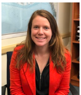
Figure 3-1, page 19