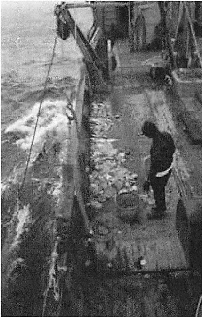
Figure 2. Scallops Being Sorted Into Baskets