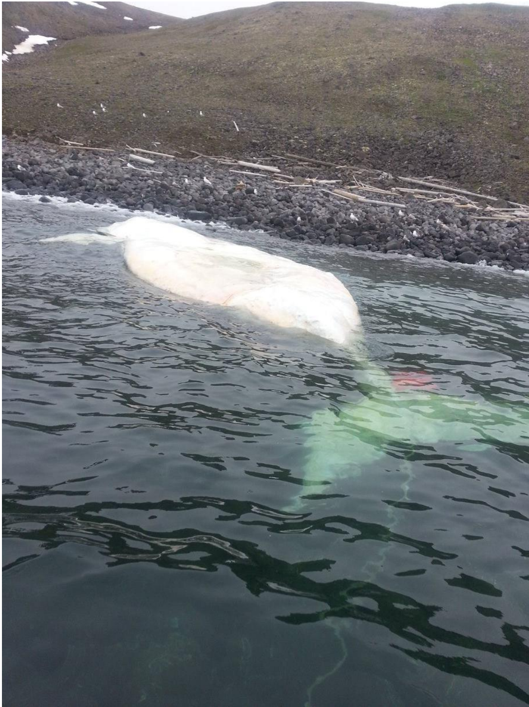
Figure 1. Adult bowhead whale (2015FD2) entangled in commercial pot gear found floating dead July 2015 approximately 20 miles east of Savoonga, Saint Lawrence Island.