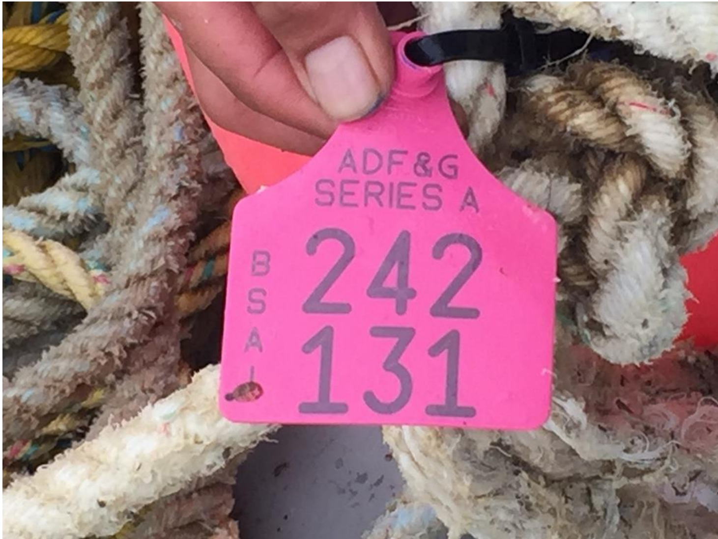
Figure 4. ADF&G Series A Bering Sea Aleutian Island Limited Entry Pot Permit Tag attached to recovered gear.