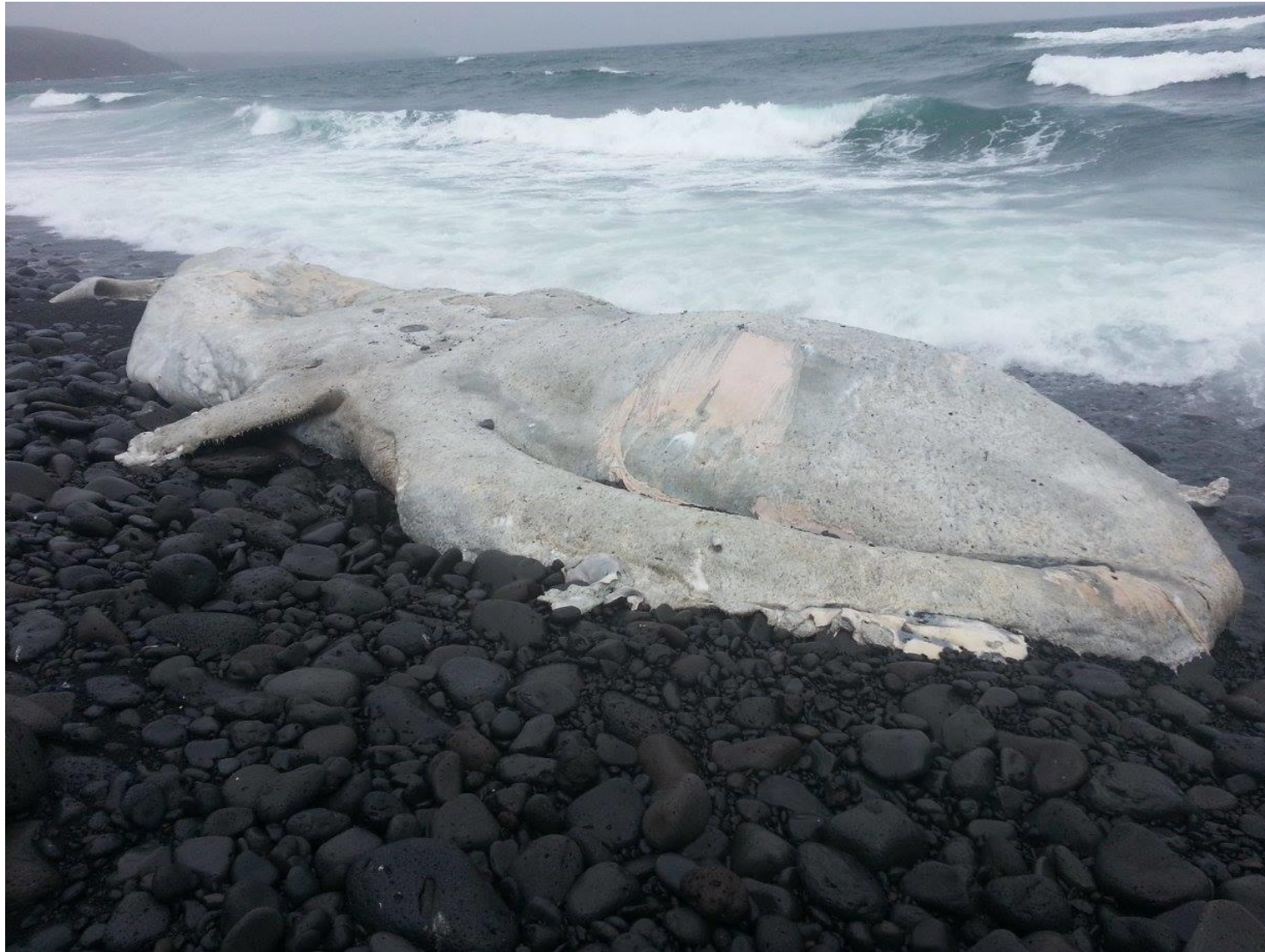
Figure 5. Bowhead whale carcass (2015-FD2) landed July 13, 2015 on beach east of Savoonga, Saint Lawrence Island.