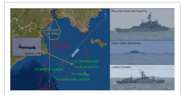
Map showing locations of the Russian military in the EEZ.