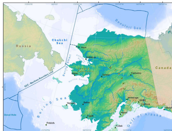
Arctic FMP management area includes EEZ waters off Alaska north of Bering Strait.