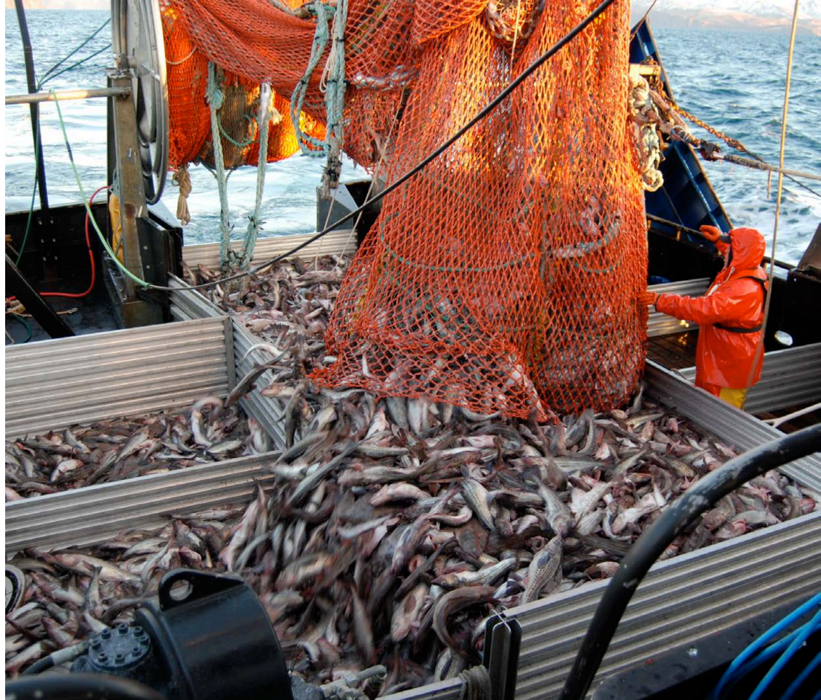
Pollock being hauled on deck.