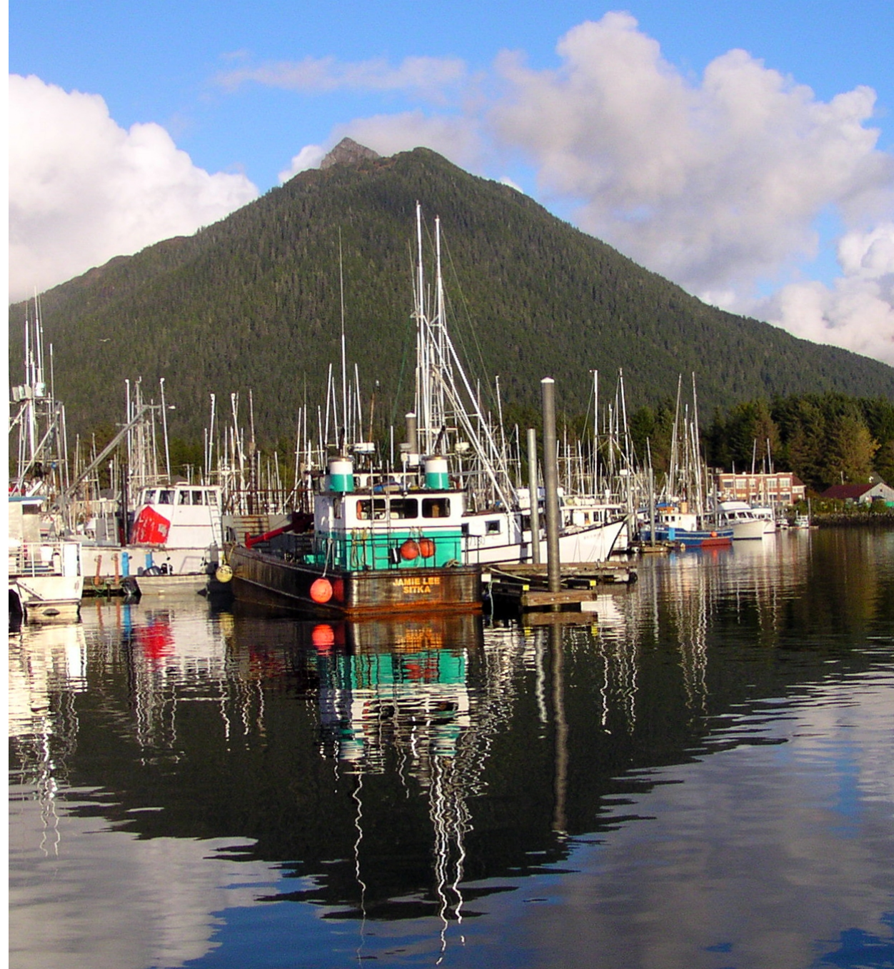
Sitka harbor.