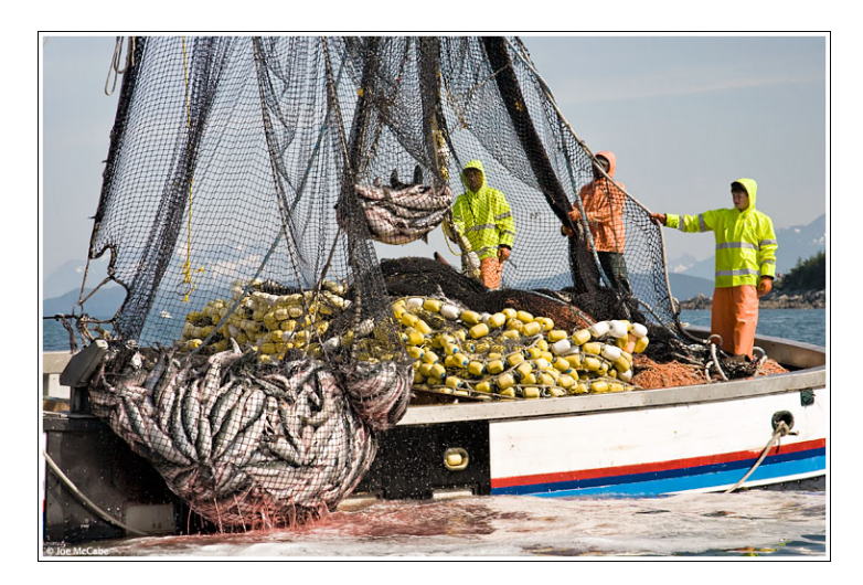
Seining for Salmon

Finally, the Council also passed a motion to hold an informational workshop for stakeholders, agencies, and other interested participants on the FMP before the September Council meeting (details TBA). Staff contact is Sarah Melton.