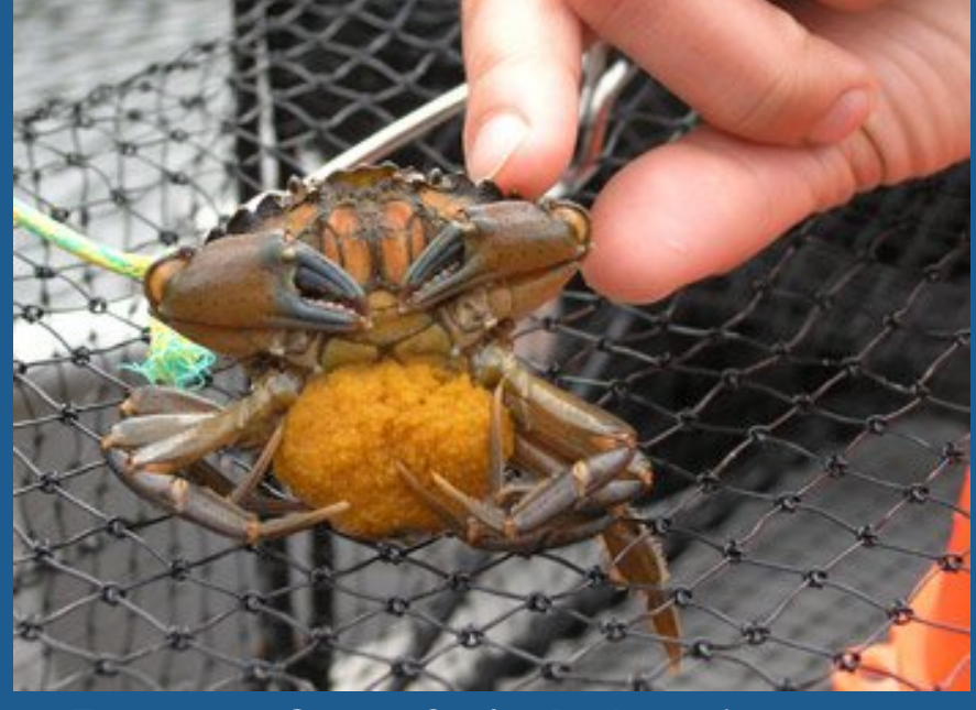
European Green Crab: An Invasive Species Moving North Towards Alaska

Didemnum vexillum, colonial tunicate discovered in Sitka and infesting a large area of the Georges Banks fishing grounds