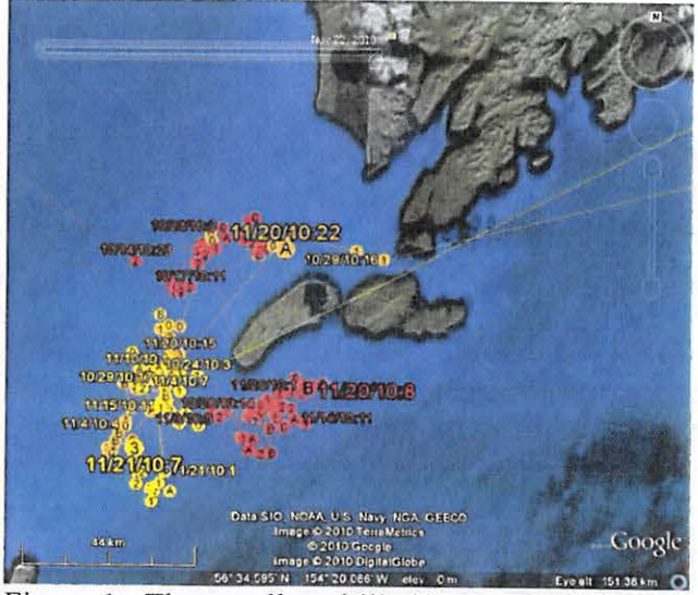
Figure 1. Three yellow-billed loons - 1 per color.

The yellow-billed loon is a Candidate Species for listing under the Endangered Species Act and has been the subject of ongoing research by personnel from the USGS Alaska Science Center (ASC). Over the past decade, ASC staff have been attaching satellite transmitters to breeding yellow-billed loons ( Gavia adamsii ) to document population-specific links to migration and wintering areas. Recent findings indicate that a small number of yellow-billed loons marked at Daring Lake (Canada) are now wintering off the southwest end of the Kodiak Archipelago, around Tugidak Island at distances of 8 to 40 km offshore (see graphic below). The loons arrived near Tugidak Island between 14 and 29 October and are expected to continue residing at the southern end of this archipelago until May. For more information, contact Joel Schmutz, USGS/ASC, at: jschmutz@usgs.gov or 907-786-7186.