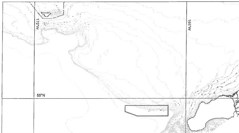
Figure 2. Chinook Conservation Area

There were no violations of the CCAA in 2017.