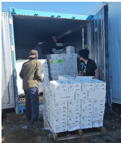
Re-filling Our freezer in Dillingham