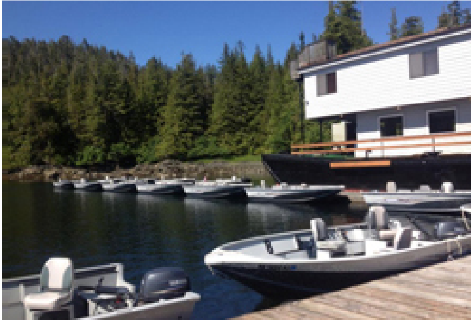
Figure 2-4 Picture of a floating lodge