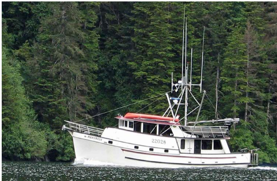
Figure 2-3 Picture of a multi-day guided fishing vessel

Figure 2-3 is an example of a multi-day guided fishing vessel. This vessel is a 60-foot charter fiberglass vessel with five staterooms. There is room for up to six anglers. The vessel may go 50 miles each day, depending on the fishing, the weather, and the clients' requests. One or more smaller vessels are often associated with this type of fishing vessel. Each trip's itinerary is personalized.