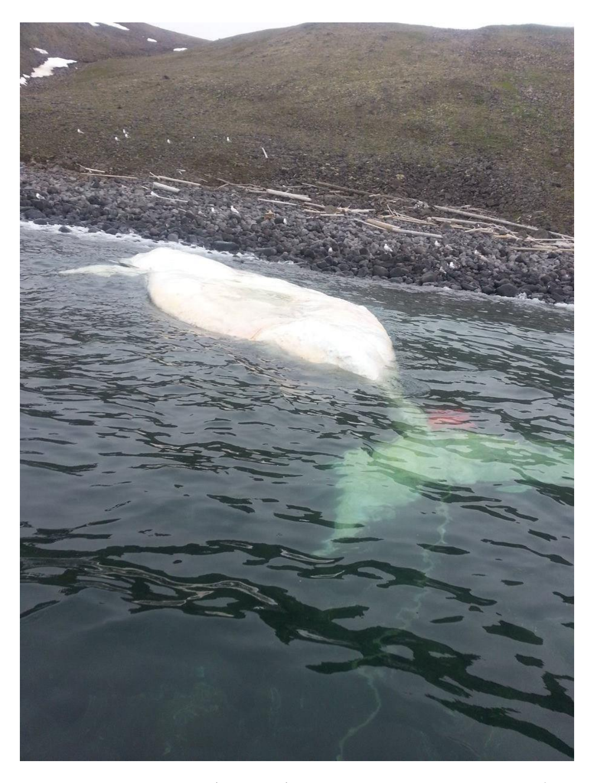
Figure 1. Adult bowhead whale (2015FD2) entangled in commercial pot gear found floating dead July 2015 approximately 20 miles east of Savoonga, Saint Lawrence Island.