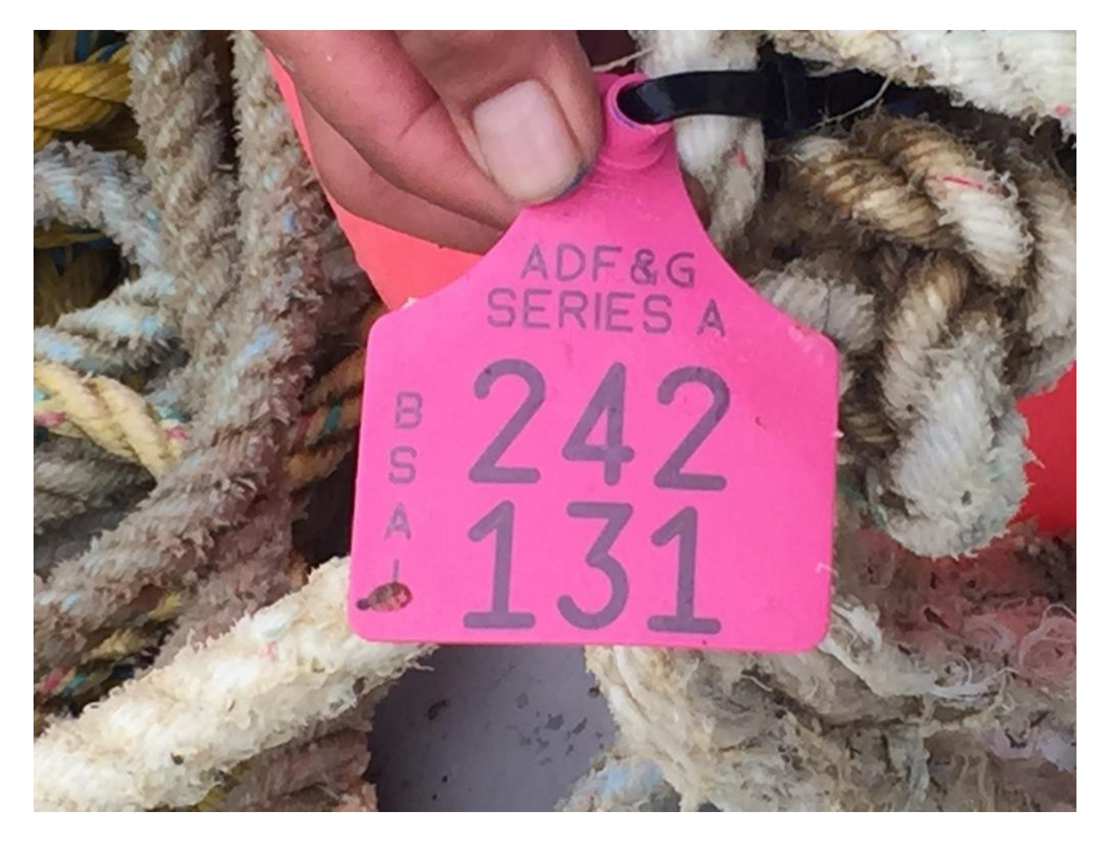
Figure 4. ADF&G Series A Bering Sea Aleutian Island Limited Entry Pot Permit Tag attached to recovered gear.