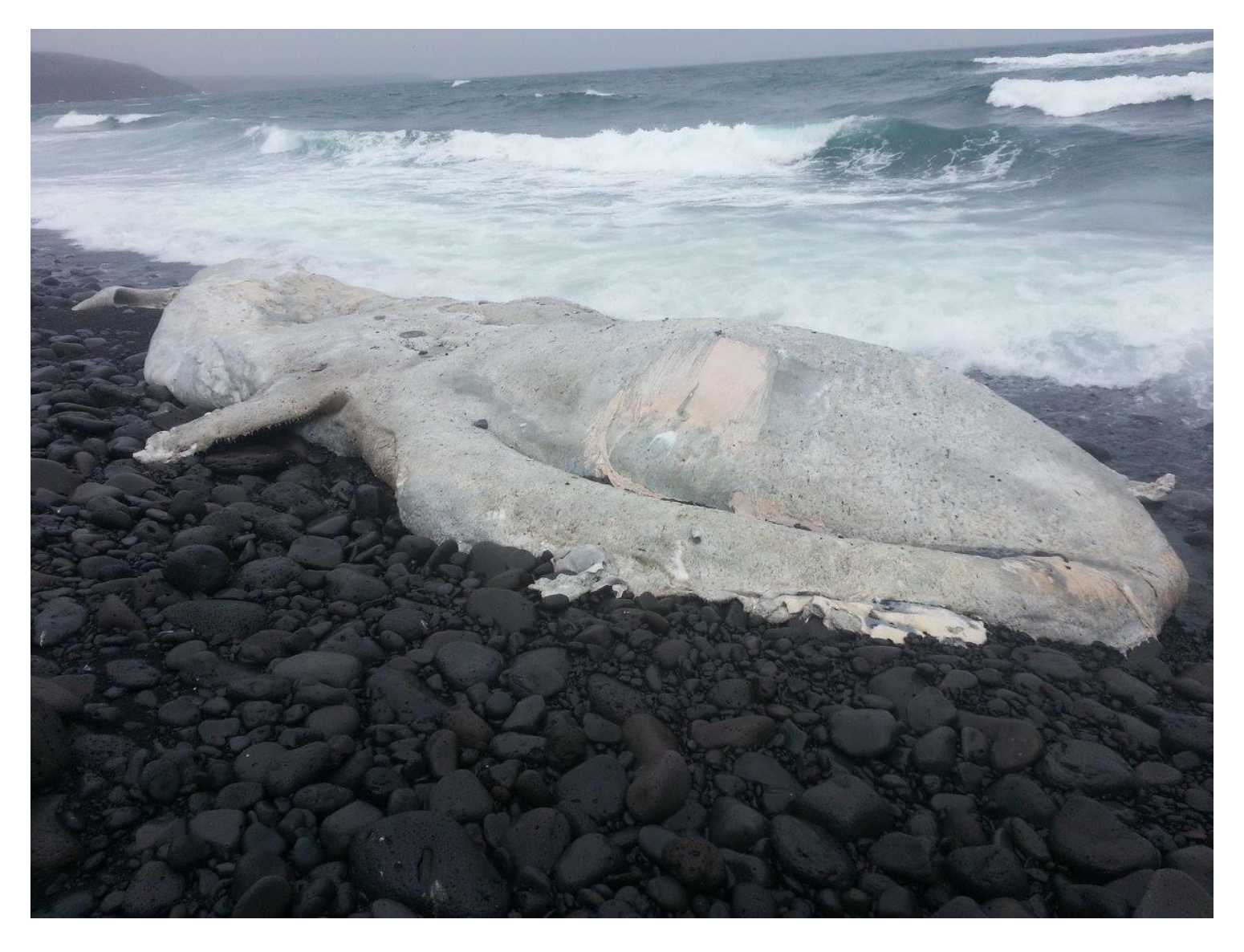
Figure 5. Bowhead whale carcass (2015-FD2) landed July 13, 2015 on beach east of Savoonga, Saint Lawrence Island.