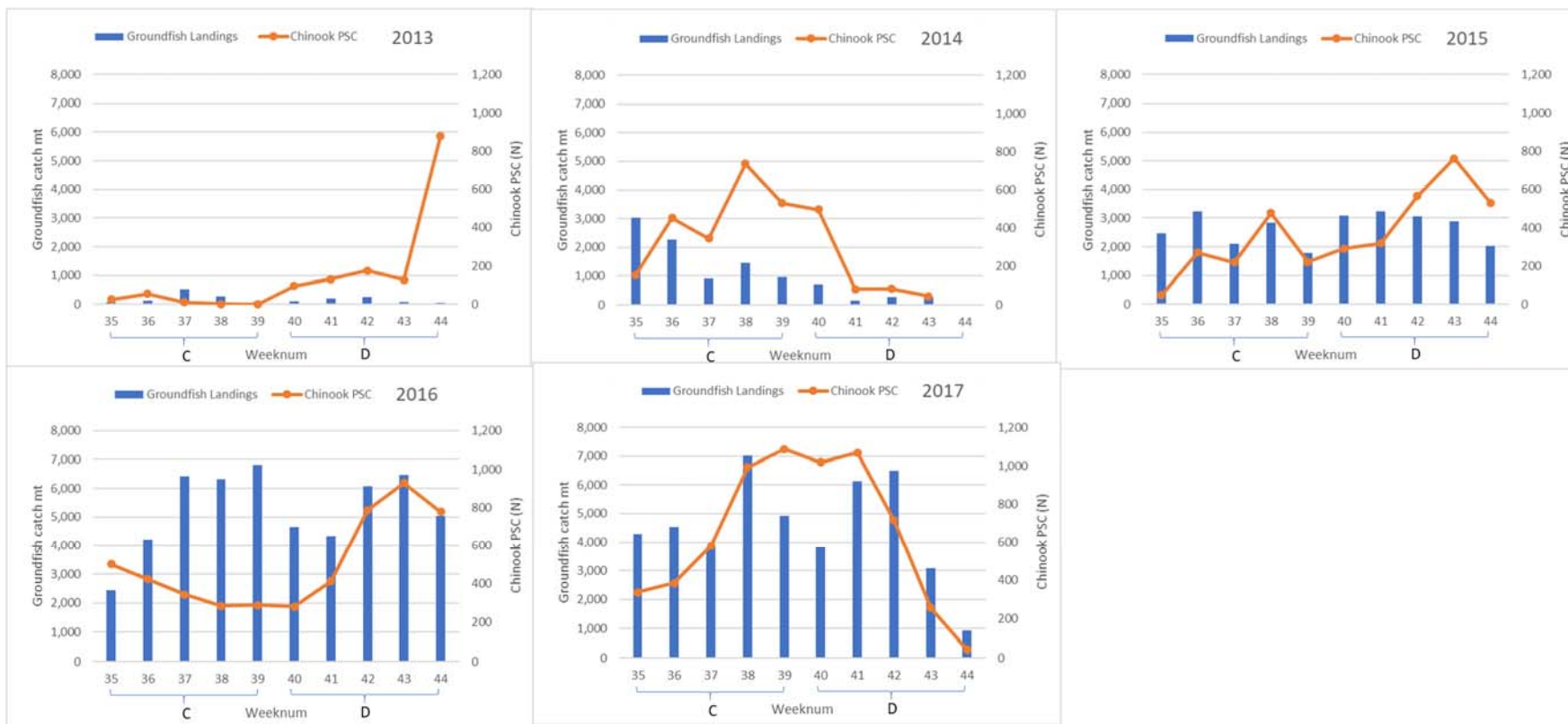
Figure 2. Overlay of WGOA groundfish catch from targeted pollock trawl trips during trawl C and D seasons and Chinook PSC rate for each year 2013 - 2017. Source: AKFIN Prohibited Species Bycatch database.

Corrected Figure 2 on page 7 of the posted document: Y axis scale is consistent so as to communicate annual variation adequately