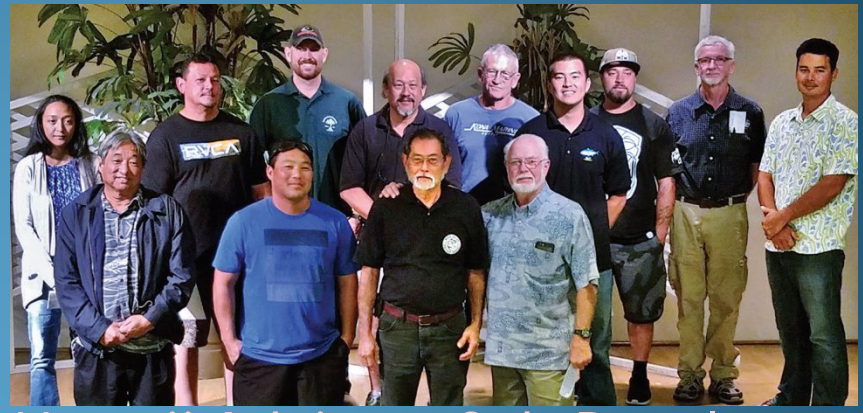
Hawaii Advisory Sub-Panel