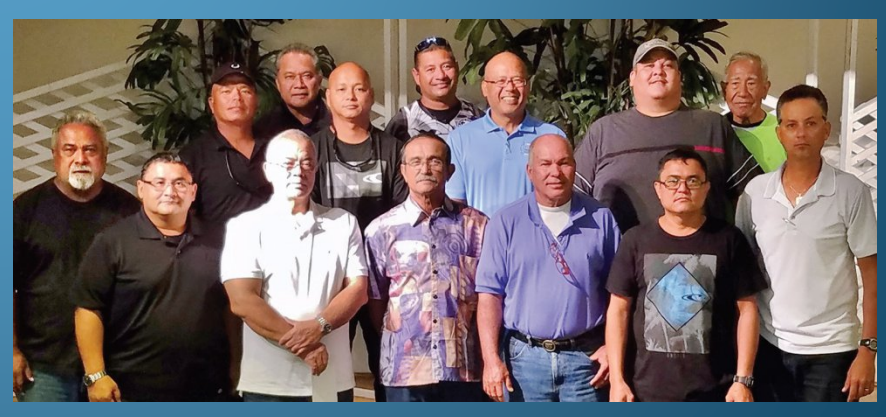
CNMI Advisory Sub-Panel