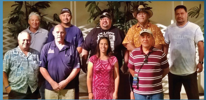
American Samoa Advisory Sub-Panel