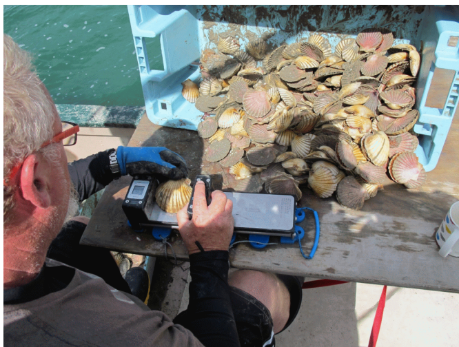
Figure 2.- Zebra Tech measuring board.

They are small, rugged and specifically designed to operate in wet and muddy conditions. They use a push-button slider to log the distance from the umbo to the outer shell margin.