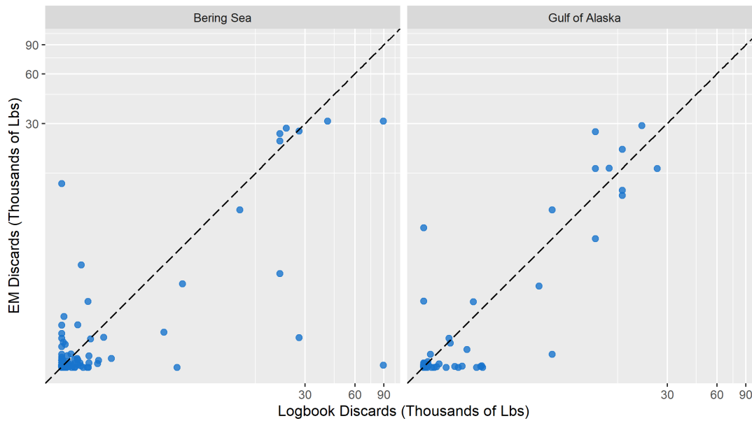
Figure 2. EM versus logbook estimates of discards by delivery in the Alaska pollock trawl fisheries, 2021. Each data point represents a sum of discards for one trip (148 trips for the Bering Sea, 113 for the Gulf of Alaska). The dashed line represents a 1:1 relationship so a perfect match of EM and logbook data will fall on the dotted line. Points above the line indicate the EM estimate was higher while points below the line indicate the logbook estimate was higher. Note that data is shown on log-2 scaled axes so that smaller discards can be better visualized. Only EM trips reviewed by April 15 th are included.