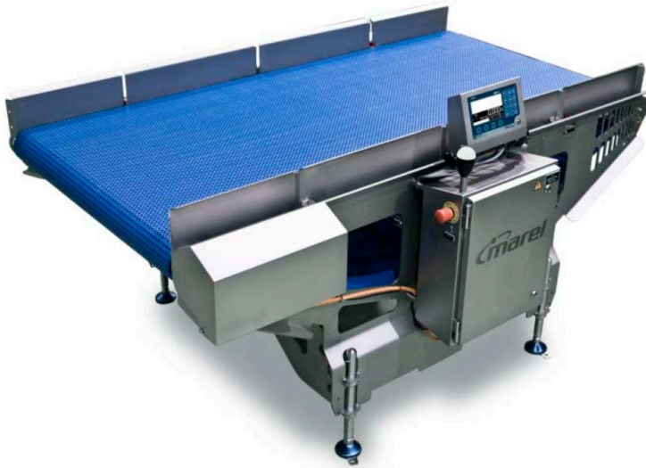
Figure 2-3 Flow scale. This image is for example purposes only and does not represent an endorsement by NMFS.