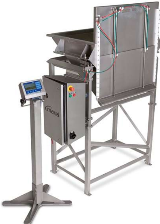
Figure 2-4 Hopper scale. This image is for example purposes only and does not represent an endorsement by NMFS.