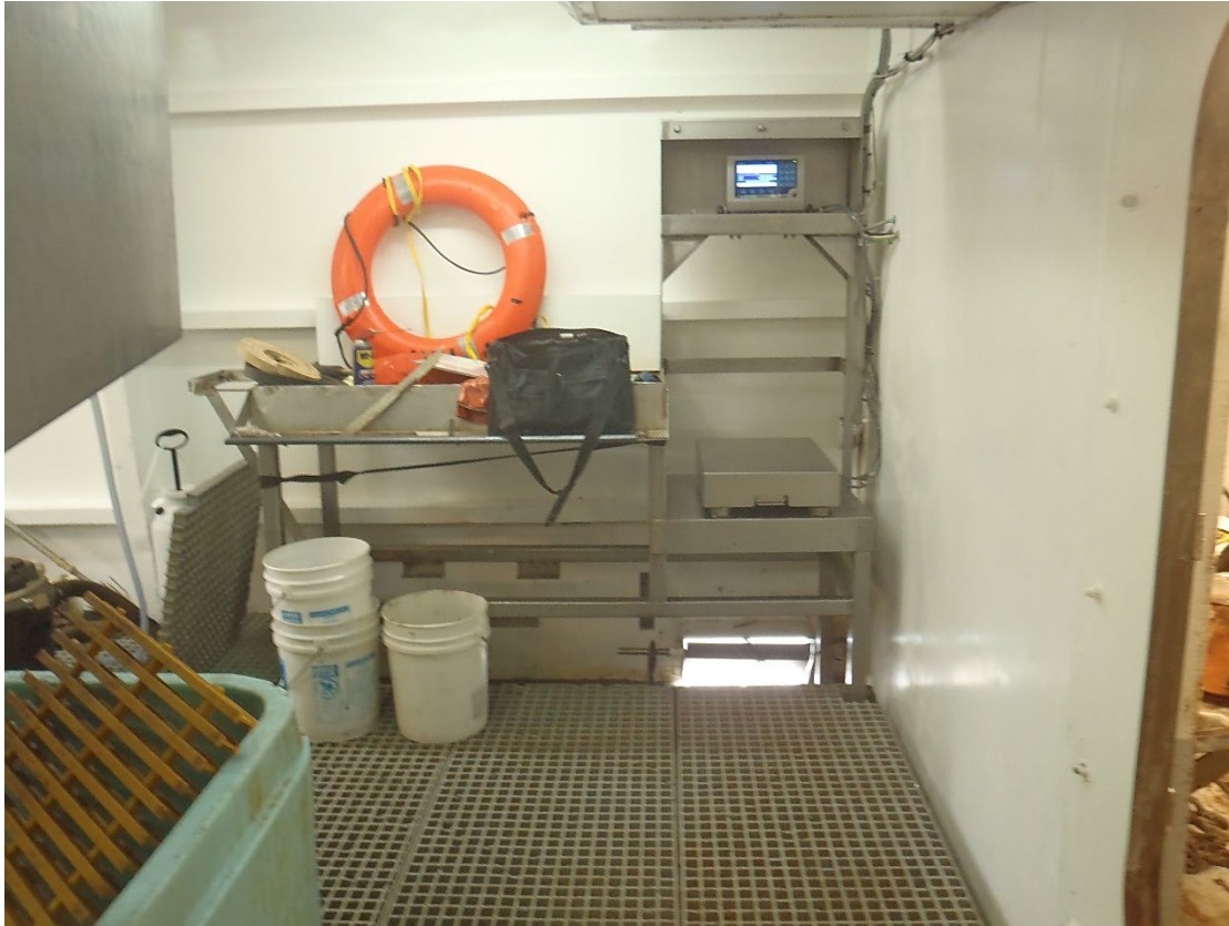
Figure 2-2 Observer sampling station with motion-compensated platform (MCP) scale.

Gulf of Alaska Rockfish Program. Additionally, all hook-and-line CPs targeting BSAI Pacific cod are also required to have an observer sampling station (77 FR 59053, September 26, 2012).