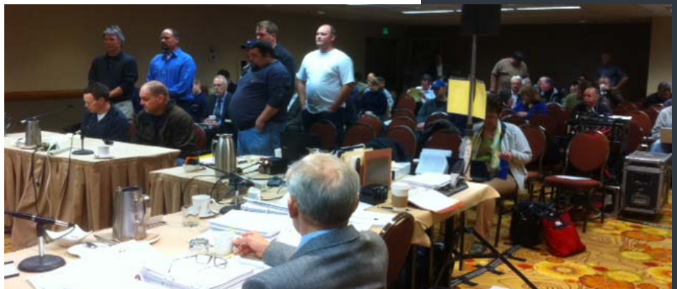
Testifiers during the Council meeting on Halibut PSC.

The Council reviewed an expanded discussion paper on issues that were raised by the Crab Plan Team during the 2010 EFH 5-year review, about the effects of fishing on crab habitat. The discussion paper addressed both general issues about the methodology used to determine the effects of fishing, as well as specific concerns about red king crab and the need to protect mature females in southwestern Bristol Bay. The Council directed staff to expand the discussion paper to consider the broad context of recruitment and protection of red king crab throughout its distribution, including the efficacy of existing closures for minimizing bycatch, especially in cold versus warm years. The Committee recommends that the discussion paper include conceptual management approaches the Council might want to consider to address potential risks to crab recruitment in cold versus warm years. The paper should include options for dynamic management in response to projections of whether the coming year will be cold or warm, or other measures, such as differential bycatch controls to protect female crab, or seasonal closures. The discussion paper should also address the ability of industry to respond to adaptive management measures outside of a strictly regulatory environment. The paper will also incorporate the results of a planned 2012 nearshore survey for red king crab, to occur this summer. Staff contact is Diana Evans.