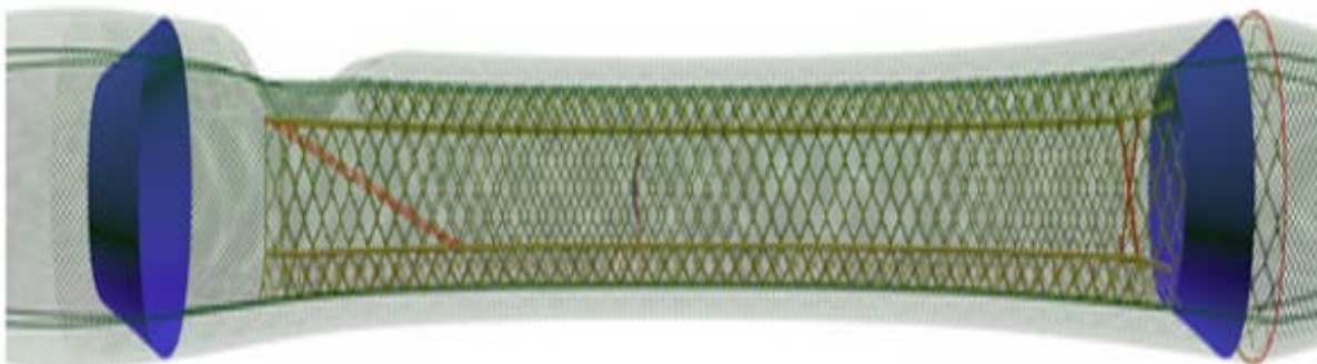
Figure 3: Conceptual depiction of a “hallway” halibut excluder (top view)

Hallway excluders can be rolled onto the vessel’s net reel with less chance of distorting the shape of the panels or damaging the excluder. The ability to roll the excluder onto the net reel saves considerable time bringing the net on board relative to earlier designs. Hallway excluders also provide considerably more surface area for separating fish and that, in conjunction with the parallel orientation to the water flow, makes hallway excluders less vulnerable to clogging and “gilling” of target fish problems experienced with earlier excluders.