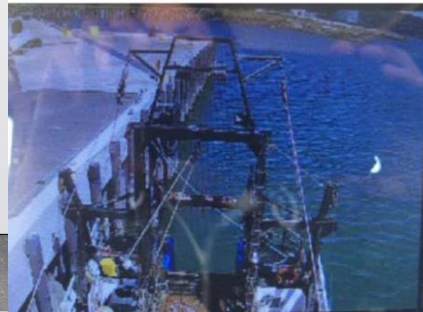
Camera View Image