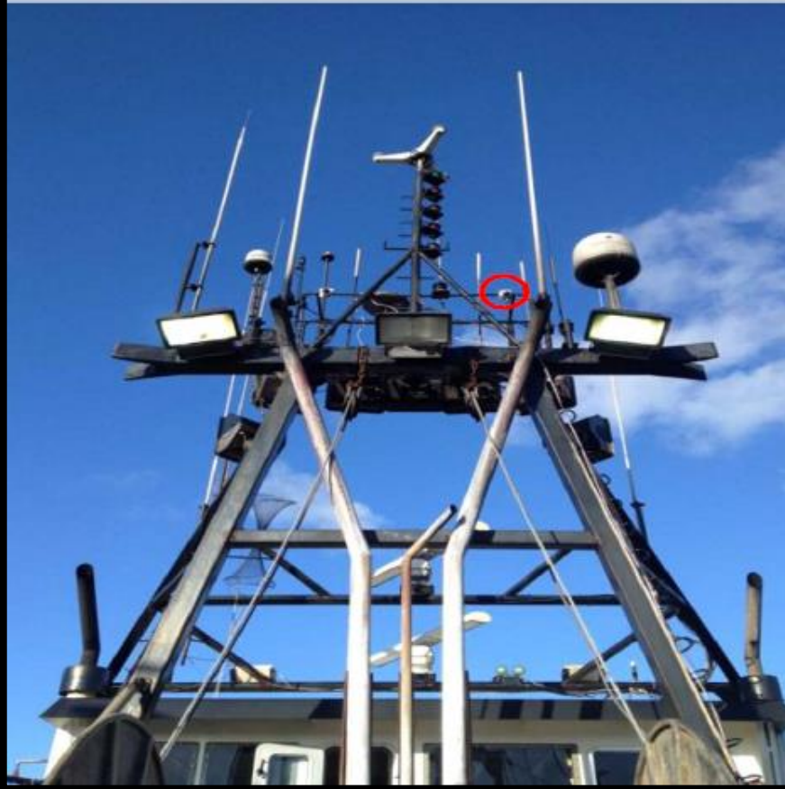
Camera Location Image