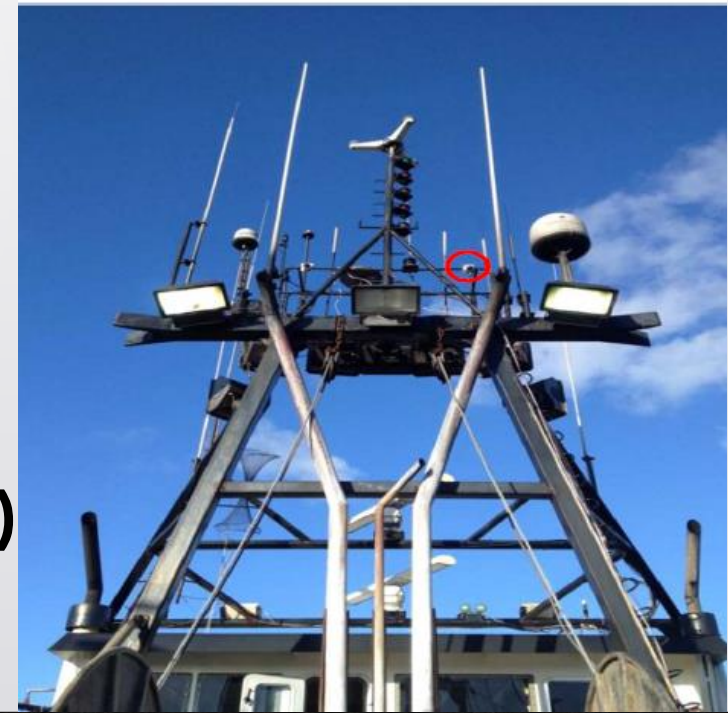
Camera Location Image