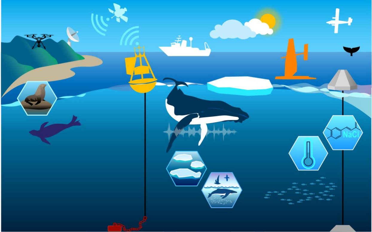
Figure 1. Schematic of current and proposed technology deployment for the eastern Bering Sea.