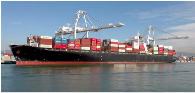
Figure 2. Container vessel