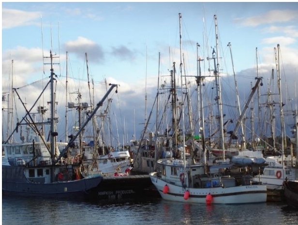
Figure 6. Commercial fishing vessels in B.C.