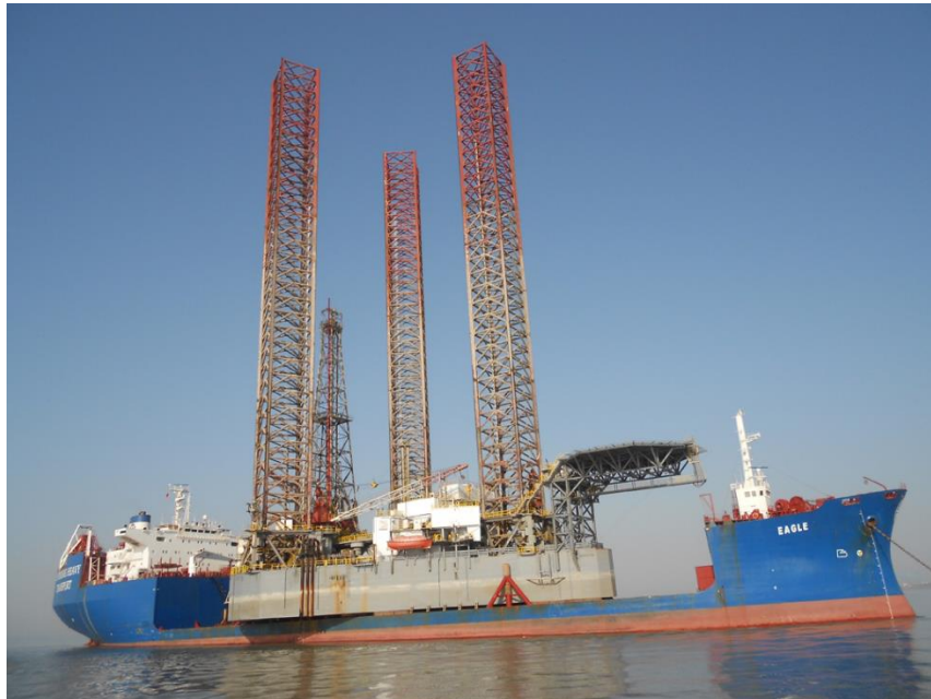
Figure 8. Jackup rig Randolph Yost being transported on a heavy lift vessel