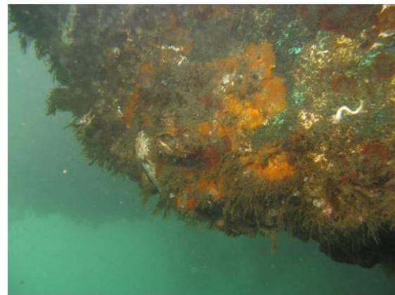
Figure 5. Biofouled recreational vessel