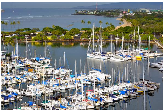
Figure 4. Ala Wai Harbor, Hawaii