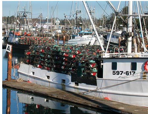
Figure 7. Commercial crab fishing vessel in CA