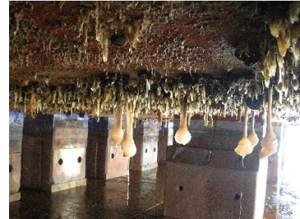
Figure 3. Biofouled vessel in dry dock