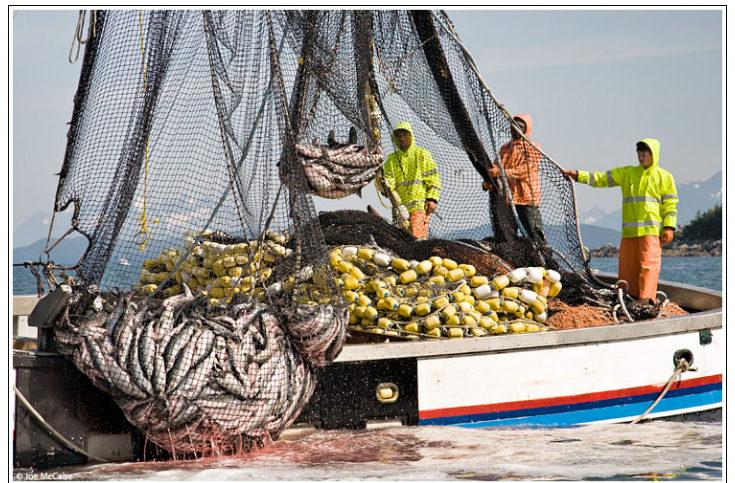
Seining for Salmon

Finally, the Council also passed a motion to hold an informational workshop for stakeholders, agencies, and other interested participants on the FMP before the September Council meeting (details TBA). Staff contact is Sarah Melton.