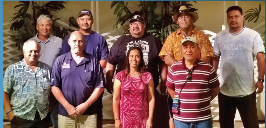
American Samoa Advisory Sub-Panel