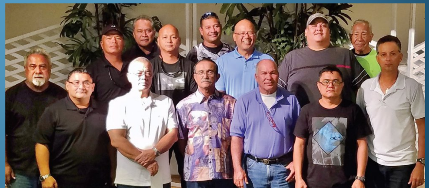
CNMI Advisory Sub-Panel