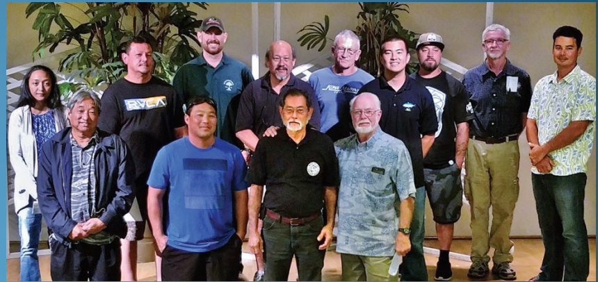
Hawaii Advisory Sub-Panel