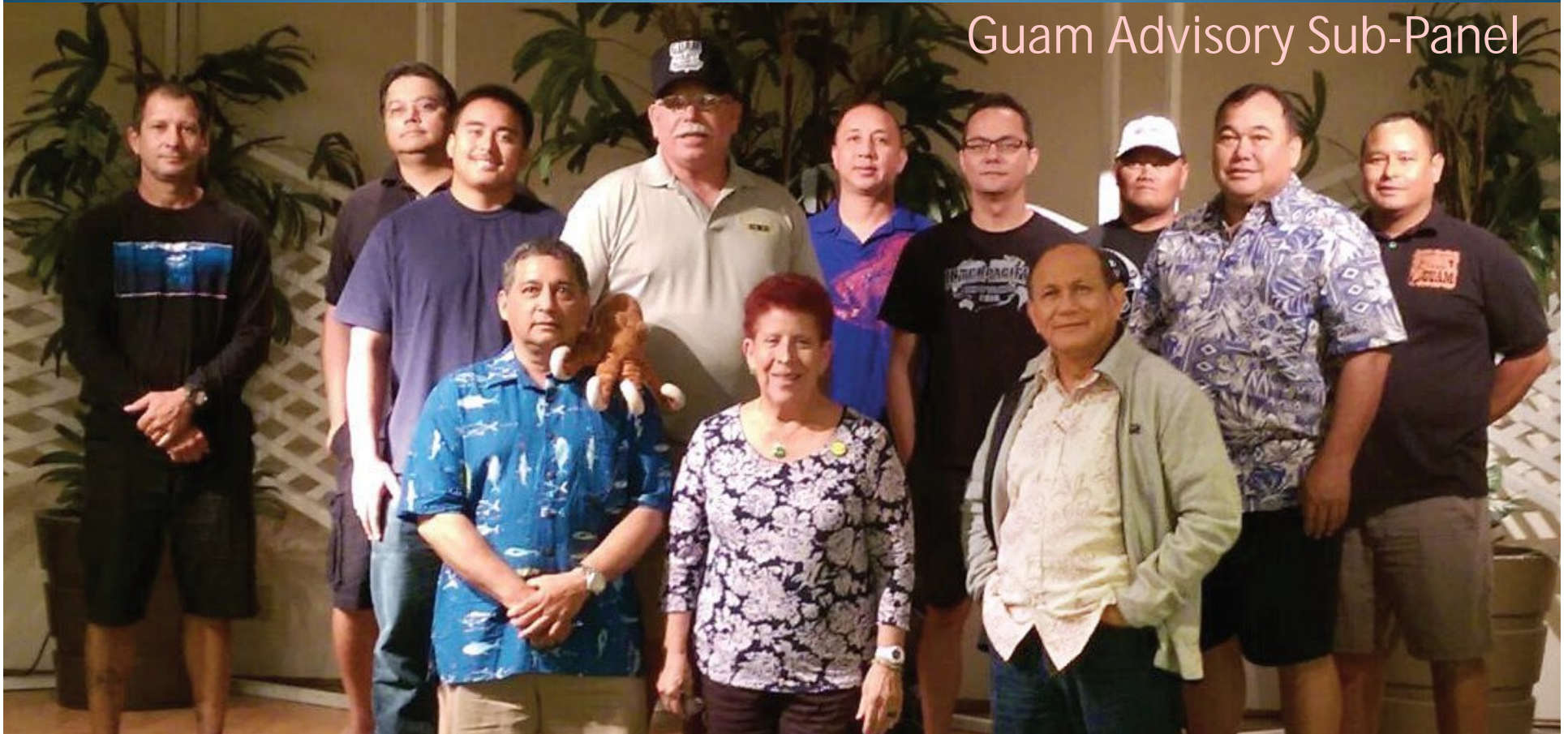
Guam Advisory Sub-Panel

Western Pacific Fishery Management Council