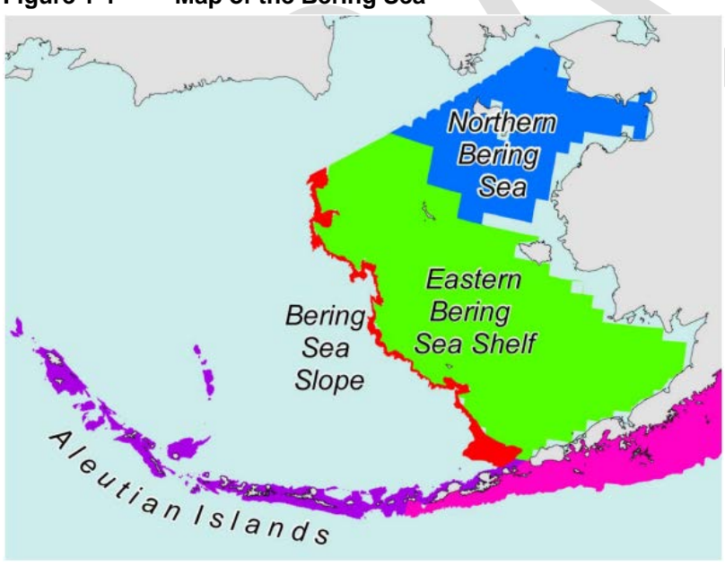
Figure 1-1 Map of the Bering Sea

Amidst these long-term dependencies, the Bering Sea is undergoing major ecological and climatological shifts that are increasingly extreme and difficult to accurately predict (e.g., marine heat waves and chances in sea ice extent that impact seabird populations, marine mammals, forage fish populations, and more) (Cheung & Frölicher 2020; Oliver et al., 2019; Pilcher et al., 2019; Reum et al., 2020; Thoman et al., 2020). Communities have long observed significant climate variability, such as higher seasonal temperatures, changes in precipitation patterns, wind patterns, storms, and ocean currents (Cochran et al., 2013; Meier et al., 2014; Wrona et al., 2006). However, the current period of changes is greatly impacting subsistence harvests and traditions (Ahmasuk et al., 2008; Bering Sea Elders Group 2011; Christie et al., 2018).