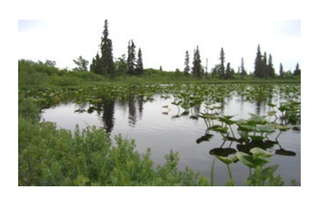
Figure 1. Denslow Lake, Chuitna watershed, circa 2002.

Snowmelt and rainfall saturate the Alaskan landscape, forming extensive freshwater wetland areas ranging from lowlands and depressions to hillsides and slopes (Hall et al. 1994). Alaska's wetlands occupy approximately 43 percent or 690,000 km² (266,410 mi²) of the state's 1.7 million km² (663,267 mi²) surface area (Dahl 1990). The majority of Alaska's wetlands are in the interior, Arctic, and western regions of the state. Only 42 percent of Alaska's wetlands are mapped (USFWS 2013).