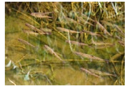
Figure 3. Salmon parr found during surveys of headwater tributaries in the upstream of the confluence of the North and South fork of the Koktuli River, 2010.

Absent data, it is best to take a precautionary approach when determining if headwater tributaries in Alaska support anadromous salmon or not. For example, many upper reaches within watersheds south of the Brooks Range still require surveys and mapping to determine the seasonal presence or abundance of the five Pacific