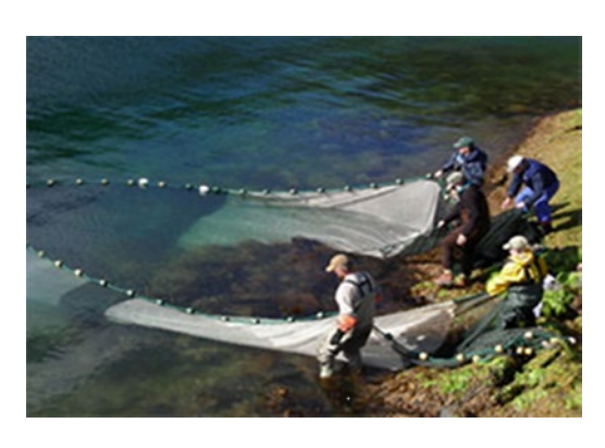
Figure 6. Scientists from Ted Stevens Marine Research Institute conducting nearshore Surveys.