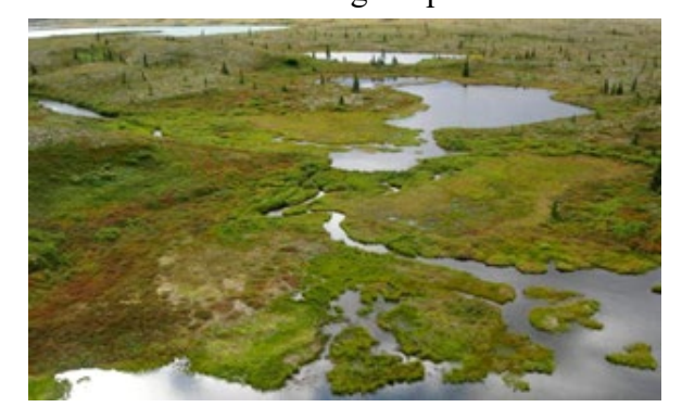
Figure 2. Wetland, pond, stream complex; headwaters upstream of the confluence of the North and South fork Kotuli's, circa 2010.

Headwater streams provide habitat complexity, increased prey availability, and refuge from predation (Meyer et al. 2007, Whigham et al. 2012). In Alaska, headwater streams are abundant and can be an important spawning and rearing habitat for juvenile salmonids (Woody and O'Neal 2010, Copeland et al. 2014). Food webs in headwater reaches are reliant on terrestrial subsidies from invertebrates, riparian areas, and instream nutrients (Piccolo and Wipfli 2002, Wipfli and Gregovich 2002, Walker et al. 2012).