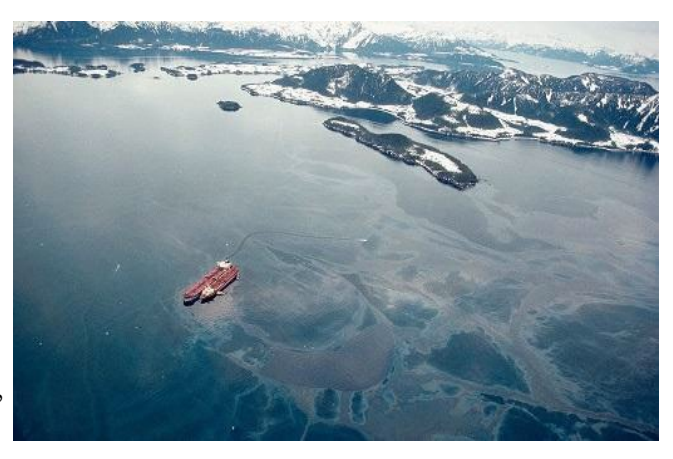
Figure 9. Aerial photograph of the Motor Vessel Exxon Valdez, circa March 1989.

One such gas leak occurred in Cook Inlet in 2021, when aging infrastructure from an oil platforms natural gas pipeline ruptured leaking between 5,947 to 9,203 m<sup>3</sup>(210,000 to 325,000 ft<sup>3</sup>) of natural gas (98.67 percent methane and other hydrocarbons) per day. The leak was discovered on February 7, 2017, and before coming under control was believed to have released 235,030 m<sup>3</sup> (8.3 million ft<sup>3</sup>) of natural gas<sup>41</sup>. Since then there were several other leaks of lesser volumes, all more readily put under control.