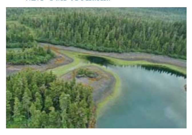
Figure 5. Eelgrass (Zostera marina) in Prince William Sound. Published in Coastal Impressions, A Photographic Journey along Alaska Gulf Coast; A.P.J., 2012.

The GOA stretches west from the Alaska Peninsula near Kodiak Island to the southern tip of Prince of Wales Island. Its northern boundary is the coast of Alaska and the southern extent is a line from the southern end of Kodiak Island to the Dixon Entrance. It includes Cook Inlet, Prince William Sound, the Copper River Delta and the 400-mile long Alexander Archipelago. In southeast Alaska, the Alexander Archipelago has over 2,900 estuaries encompassing a total surface area of 30,721 km<sup>2</sup> (11,861 mi<sup>2</sup>) (Albert and Schoen 2007). At 1,181 hectare (2,900 acres), the Stikine River Delta is the largest of these estuaries. The GOA includes two large estuary systems: Cook Inlet, which is approximately 370 km<sup>2</sup> (230 mi<sup>2</sup>) with the