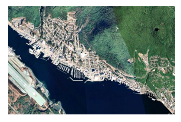
Figure 8. Satellite image of shoreline coastal development, generated using Google Earth Pro.

installation or removal. Concrete and steel, on the other hand, are relatively inert and do not leach contaminants into the water.