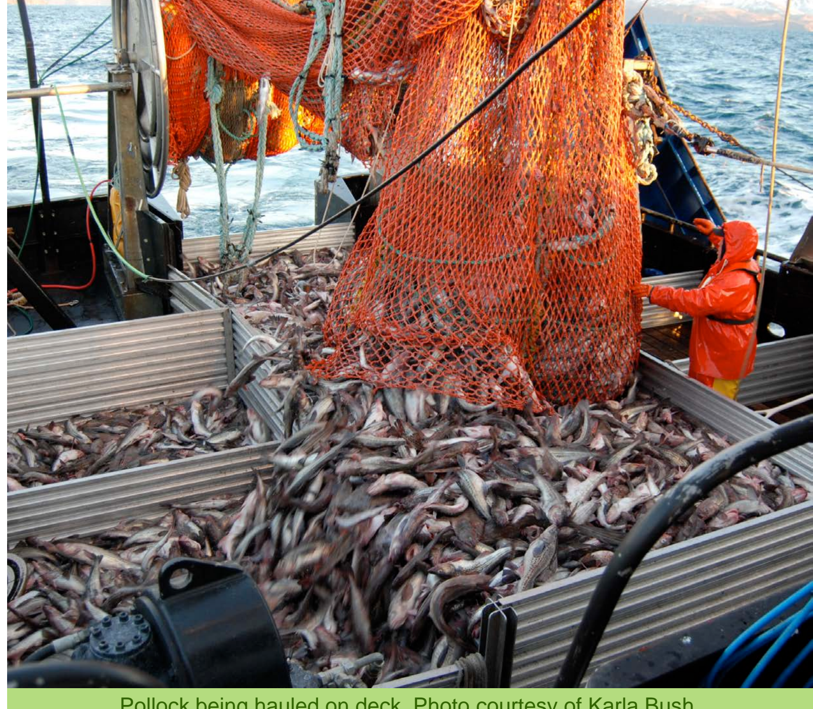
Pollock being hauled on deck.

32 amendments occurred while Peggy Kircher was on Council staff.