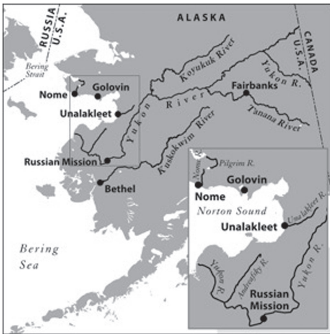
Fig. 1. Study area.

fisheries management accompanied by recommendations for this integration (Figs. 1 and 2).