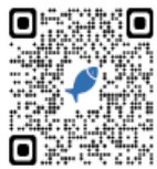
Program Review Schedule & Current Reviews