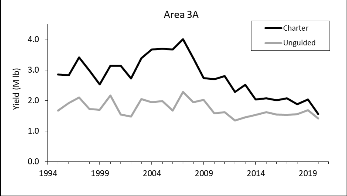
Figure 2.1. Charter and Unguided halibut yield (M lb) in Area 3A since 1995.