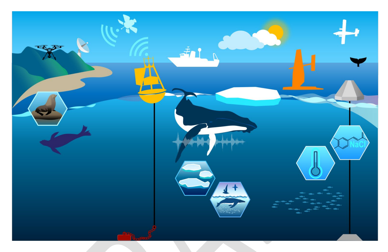
Figure 1. Schematic of current and proposed technology deployment for the eastern Bering Sea.