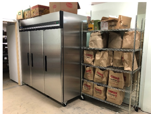
New Freezer at Salvation Army, Kodiak

2 communities - St. Paul and Kodiak - have received restaurant-style, reach in freezers.