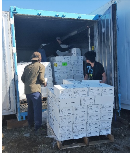
Re-filling Our freezer in Dillingham