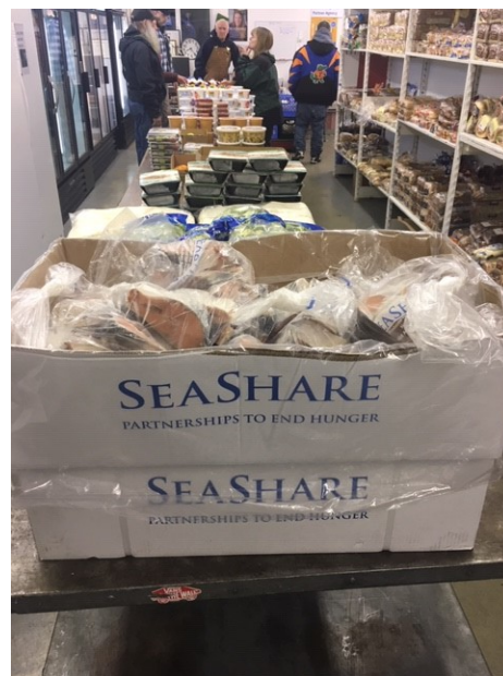
Our new freezer for the South East Alaska Food Bank in Juneau

2 communities - St. Paul and Kodiak - have received restaurant-style, reach in freezers.