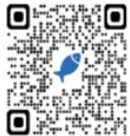
Program Review Schedule & Current Reviews