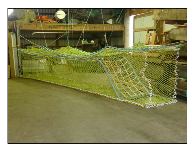
Figure 2: Hallway Halibut Excluder